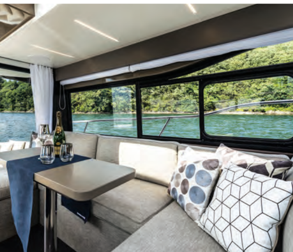
The salon features plenty of glass all around, including a sliding window on both sides.