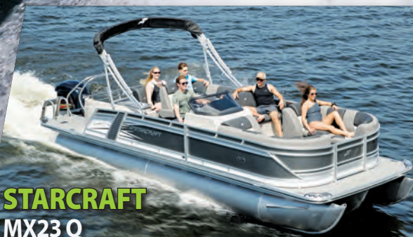
STARCRAFT MX23 Q