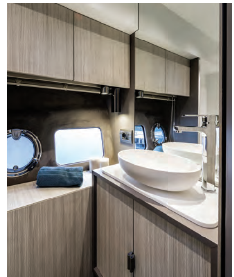
The light cabinetry and large mirrors make the port-side head appear large and spacious.