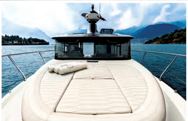
The wide sidewalk and flat bow area provide a myriad of opportunities. Notice the nearly vertical windshield.