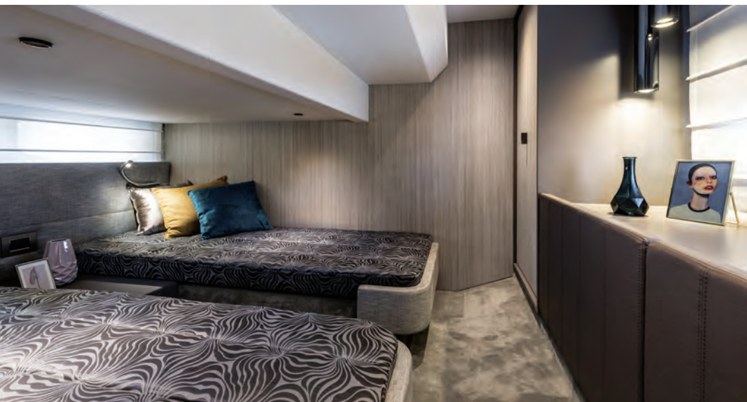
I would choose to use the full beam mid-cabin as the master suite in the three cabin layout.

Move down four steps to the accommodations deck. On our test boat, the accommodations deck was set up with the three stateroom and one head layout option. You could order the T36 with two staterooms and two heads for more privacy. The two main berths are large and bright, especially for a boat of this size. What I would use as the guest cabin is forward and features an island v-beth with two opening ports and a large overhead hatch for plenty of air circu-