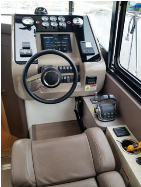
The single helm seat and compact but efficient dash layout don't overwhelm the cabin space.

height sliding glass door, you'll find the galley to starboard. It is well equipped with an electric two-burner stove, a single stainless steel sink large enough to actually prep dinner or do dishes in, and a Dometic fridge below the counter concealed behind a cabinet door that matches the rest of the cabinetry in the boat. Storage space isn't massive but it's more than ample to let you escape for a long weekend, only needing to re-provision every few days if you're on an extended journey.