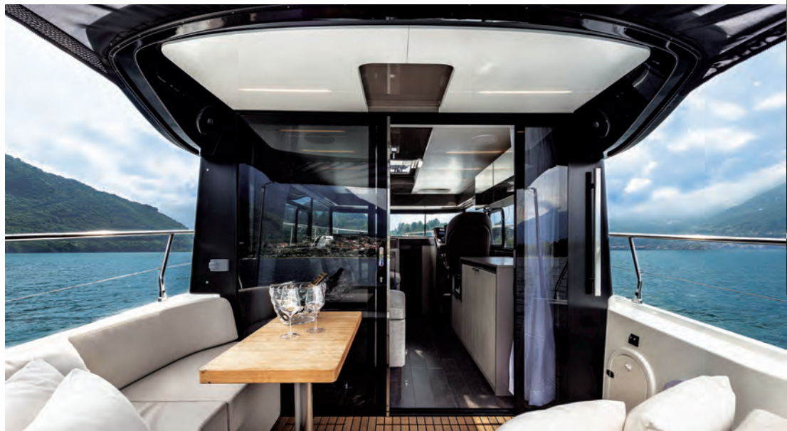
A teak sole in the aft cockpit adds elegance and tradition to the outdoor lounging and dining area.

To port, a large u-shaped sofa wraps around a table that drops down to create another berth when necessary. Sitting here, or standing in the galley, you're surrounded by big beautiful windows that let the outside