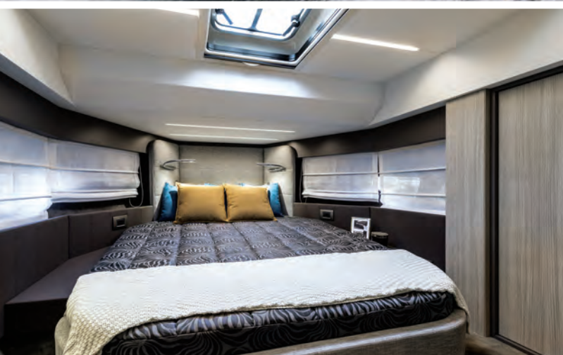
In the three cabin layout, the v-berth would likely function as the guest cabin with a queen island berth and generous headroom.