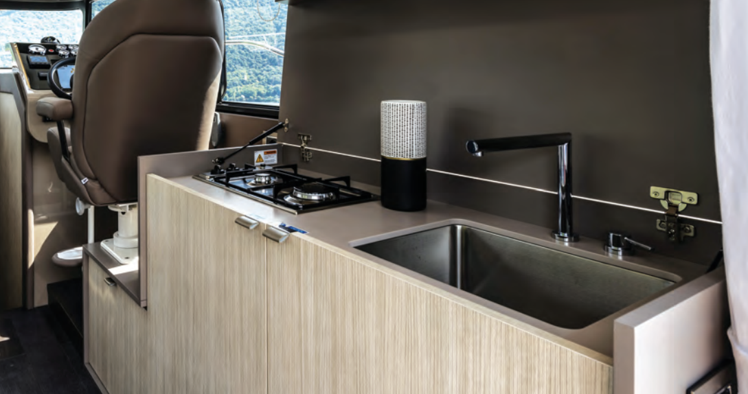
The starboard-side galley features a two-burner stove, stainless sink and undercounter fridge and storage in a compact design.

lation for those nights that you don't want to run the optional heat or air conditioning. There's a TV for some private viewing when your guests may need to escape and get some alone time, as well as hanging storage and reading lights. My choice for the master stateroom is aft and uses the full beam of the boat under the cabin. It features twin single beds with a filler cushion to make the bed into a king, generous and convenient storage space on the port side, a full length hanging locker and reading lights.